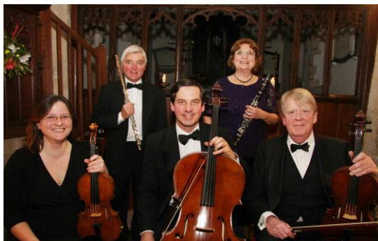
Fenharmonics, a group of local musicians, entertained a packed St Peter's church on 1 November