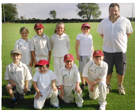
(right) Upwood Under 9s cricket team are pictured before a match at Warboys this summer.