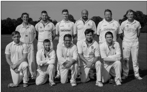
Upwood vs Hampton