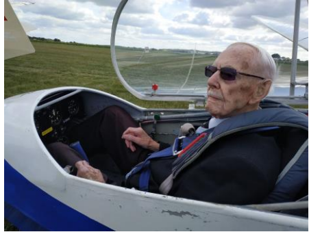
Before take-off Comparing notes after their flights