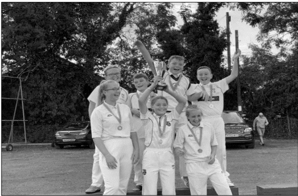
U11 County Champions