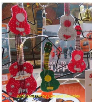
With Bells On by Up Good Book Exchange