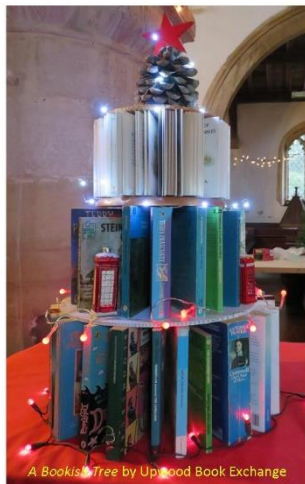
A Bookish Tree by Up Good Book Exchange