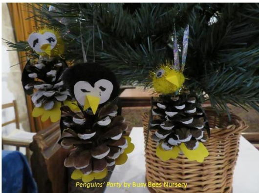
Penguins' Party by Busy Bees Nursery