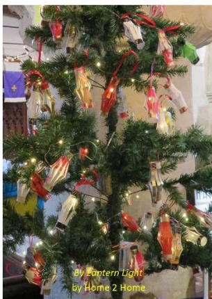
By Lantern Light by Home 2 Home