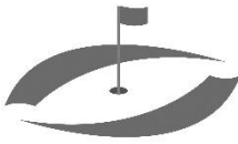
Upwood Golf Society

We are back and the Golf Society Day was the usual mixture of fun, competition and a generally good day and evening out. Given the circumstances we had a good turnout with 27 playing and five additional guests in the evening.