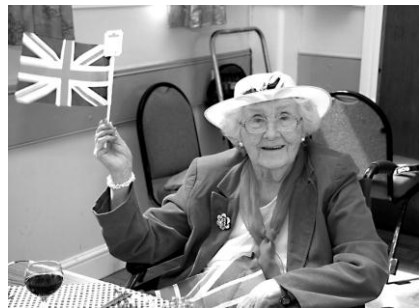
Meet and Munch Meal Upwood Village Hall Saturday 9 th June

More of your photographs inside this issue