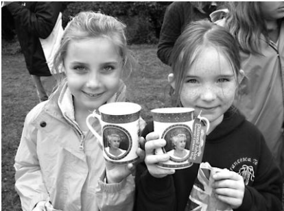
Jubilee Garden Party Cross Keys Paddock Monday 4 th June