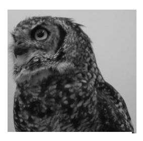
Ben, a European Eagle Owl