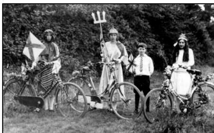
Upwood Corner, 1937