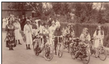
Above – 3 photos from Peace celebrations 1919