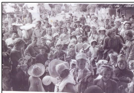
Celebration of Coronation of Elizabeth II. Fancy dress and decorated bicycles