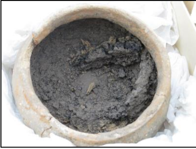
A 3000-year-old burnt meal.