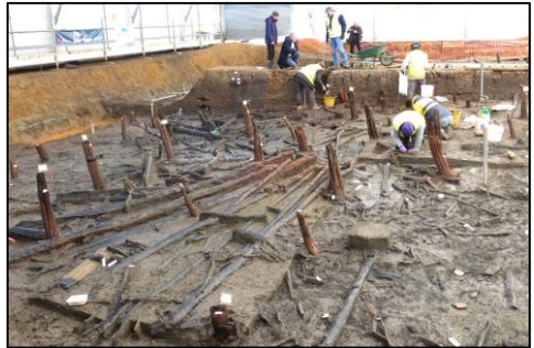
The walls (left) and roof (right) of one of the Must Farm dwellings. Despite the fire the wall structure is clearly visible.