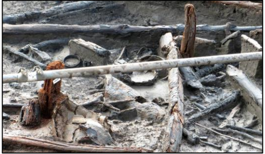
Broken cooking pots found in the ruins of the burnt-out Bronze Age house