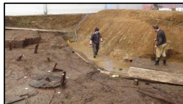
Very delicate, hot off the trowel and found just days before the group's visit – the most complete Bronze Age wheel found in this country. Above – wheel lying on the surface; left - detail of the wheel with a hint of an axel.