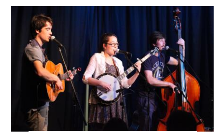
Cup O' Joe - Sept 2015