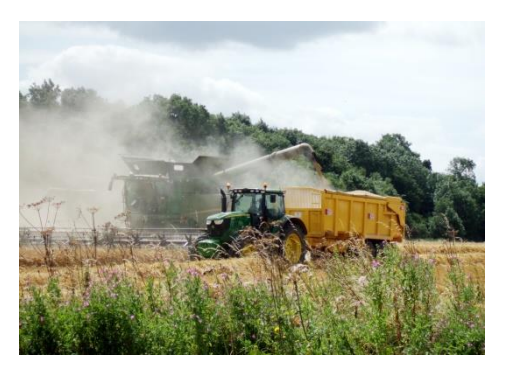
Harvesting opposite Longholme Road