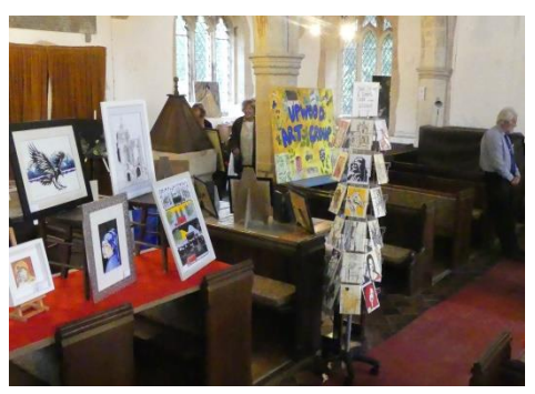
Art Club Exhibition in St Peter's Church