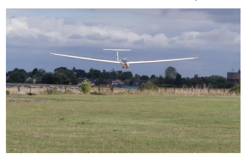
A glider landing at Nene Valley Gliding Club's Open Weekend