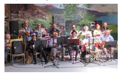
Upwood Ukuleles playing at Ramsey 1940s Weekend