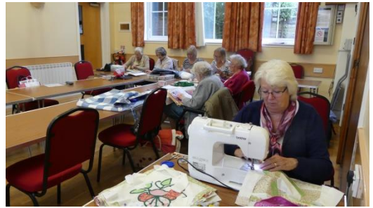
Members working on their own projects

enjoys thinking of projects that the members can make to decorate the tree. Last year the Quilt Group won 1 st prize in the competition with a wonderful display of Christmas baubles. Members are also encouraged to suggest ideas for the decorations and this year everyone has been able to choose from a quilted robin or triangular bauble.