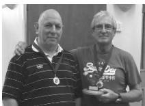
TABLE TENNIS CLUB

A coaching session held in October for the Wednesday afternoon players was well received. A professional coach was used to demonstrate the basics of the game as well as some of the finer points.