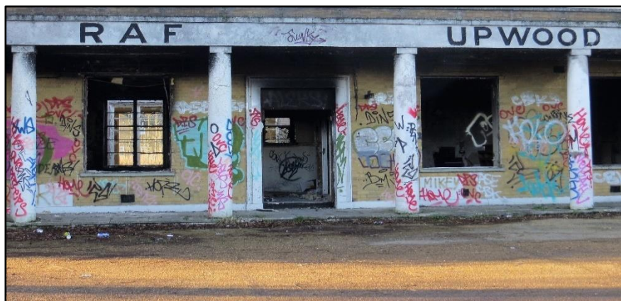
Disused Guard Room of former RAF Upwood. See page 6 for more detail