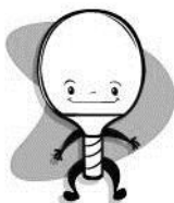
TABLE TENNIS CLUB

The afternoon outing at Ely was attended by 28 members and a "high tea" enjoyed in the Almonry Tea Rooms. More outings are planned for the future for both Tuesday and Wednesday members. On Tuesday 23 September the club had their first Handicap Doubles Tournament of the season, where 12 pairs were seeded and handicapped to give all competitors an equal chance.